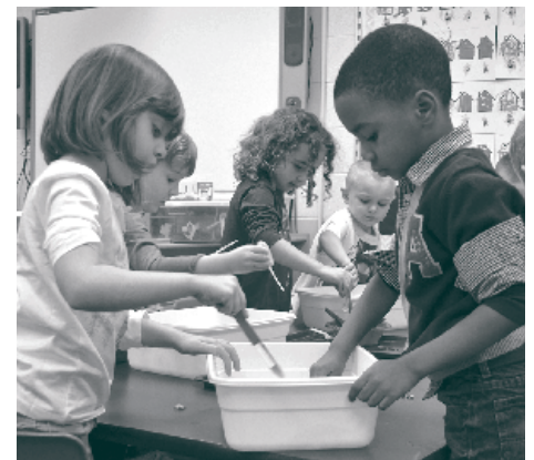
18-19 Use of Educational Funding